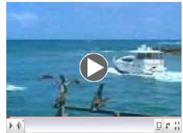
Sebastian River Area Destination Video

To learn more about all there is to see and do in the Sebastian River Area, watch our destination videos: