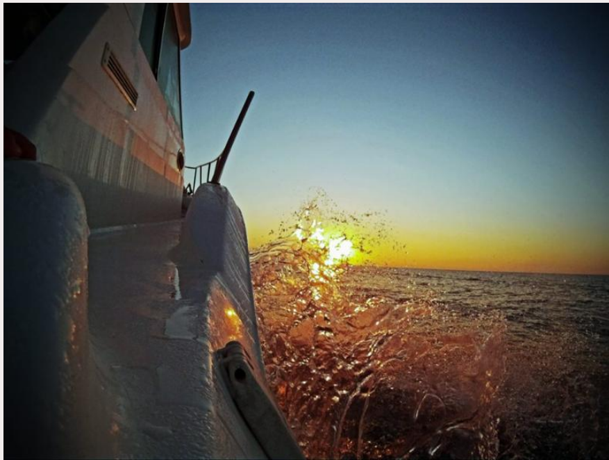
Breaking through the waves....offshore bound!

Summer is just around the corner! There's lots of summer fun to be had in the Sebastian River Area with Offshore Fishing Tournaments, Concerts, Comedy Shows, Sea Turtle Walks, a Surf Expo, Goat Yoga, a Ghost Hunt & much more! Please check out the events below and be sure to visit our website to plan your perfect getaway to the Sebastian River Area!